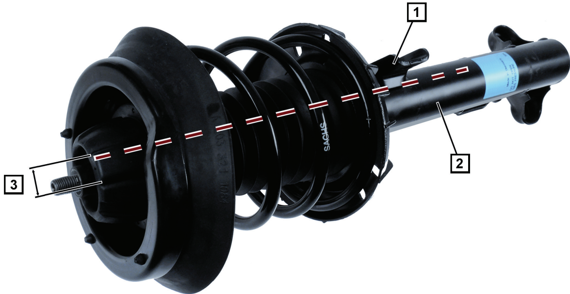
Fig. 1: Suspension strut

Mercedes-Benz C Class (CL203 / S203 / W203) Mercedes-Benz CLK Class (A209 / C209) Art. No. 802 251