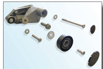
Fig. 3: Parts included (55043, 55006 plus add on material)

This replacement kit contains all the parts required for mounting the hydraulic unit as well as the pulley. (see Fig. 3)